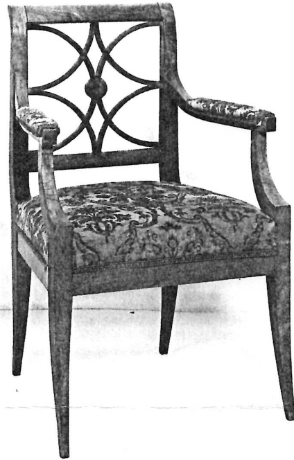
76. Biedermeier chair, c.1806-15. Height 92/46 cm, breadth 46.5/44.5 cm. (Exh. Stadtmuseum, Munich).

travellers reached Munich, but they took time to do so. Of course, styles were adapted to meet local requirements, although less on aesthetic grounds than for reasons of cost and the difficulty of importing exotic woods. The extensive use of deal and cherrywood, as well as the types of veneer, are best explained in terms of what local cabinet-makers had to hand.